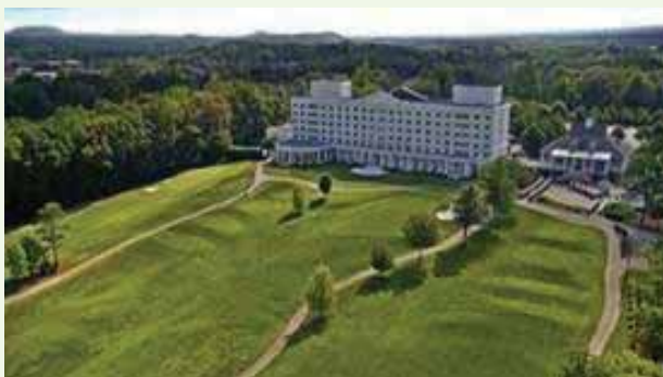
Conference will be held at the beautiful Hilton Marietta–Hotel and Conference Center